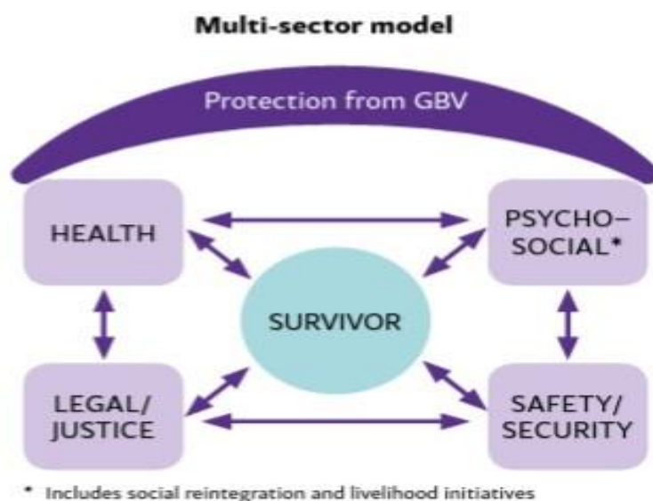
Figure 1: The multi-sectoral model.

According to the multi-sectoral model, the legal/justice sector services are situated in the wider response—they are one element of comprehensive care. It is important that no single sector acts alone within the multi-sectoral model; all are needed to ensure a full complement of services for survivors.