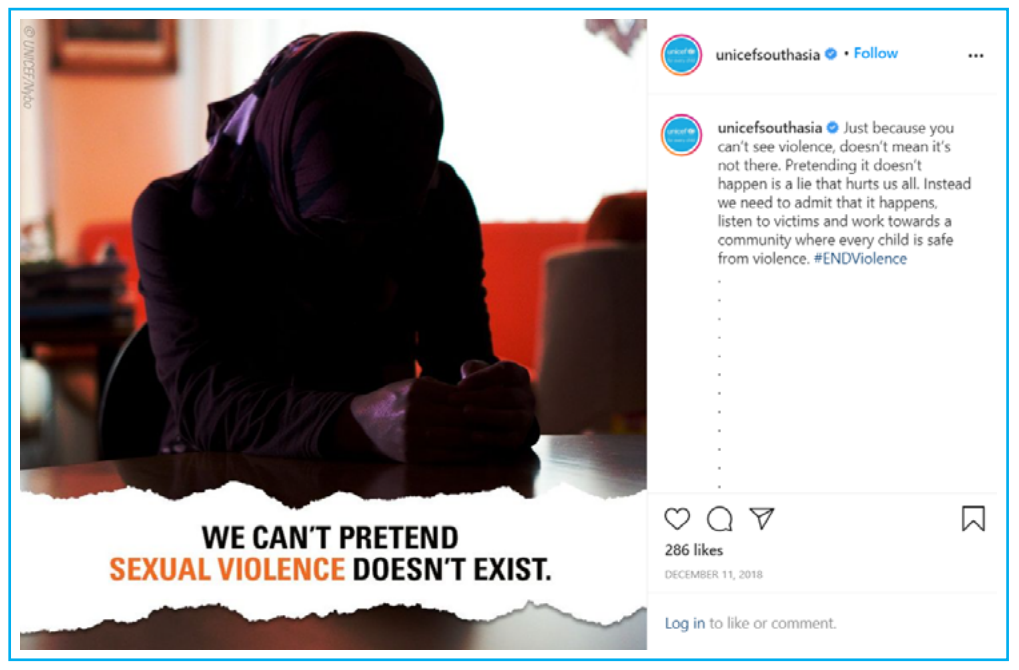
Above: example of how to obscure someone's visual identity in a photograph for confidentiality.

Always obtain informed consent before taking voice recordings, photos or videos (see 'Informed consent' section above).